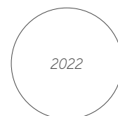
Pachy- cephalosaurus wyomingensis