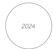
The Gold of China