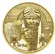
The Gold of Mesopotamia