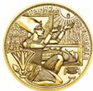
The Gold of the Pharaohs