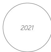
The Gold of the Incas