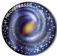
The Milky Way