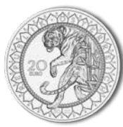
Asia – the Power of the Tiger