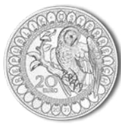
Europe – the Wisdom of the Owl