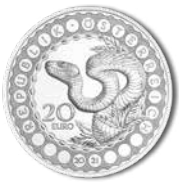
Australia – the Serpent Creator