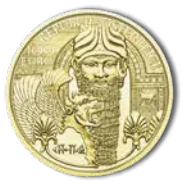
The Gold of Mesopotamia