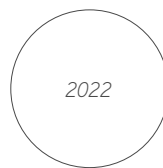
The Gold of the Scythians