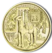
The Gold of the Incas