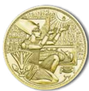
The Gold of the Pharaohs