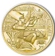
The Gold of the Pharaohs