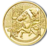
The Gold of the Scythians