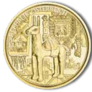
The Gold of the Incas