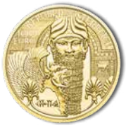
The Gold of Mesopotamia