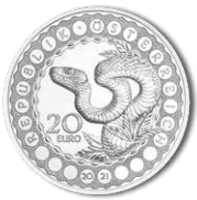
Australia – the Serpent Creator