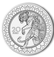
Asia – the Power of the Tiger