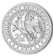
Europe – the Wisdom of the Owl