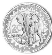
Africa – the Serenity of the Elephant