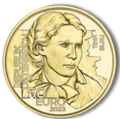
Tina Blau - Painter